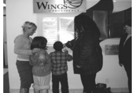
Hearts of Blue—Some kids wanted in on the picture.