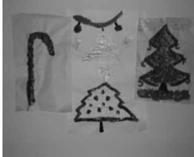
Lots of Glitter– Art work from Wings children for Christmas Bulletin Board.