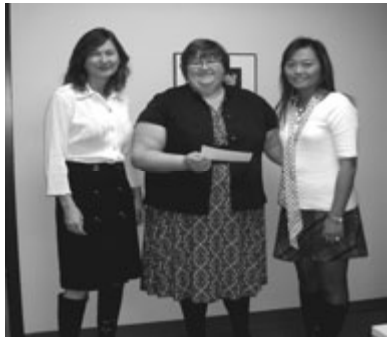
Alberta Petroleum Ladies Classic ALPC 2008