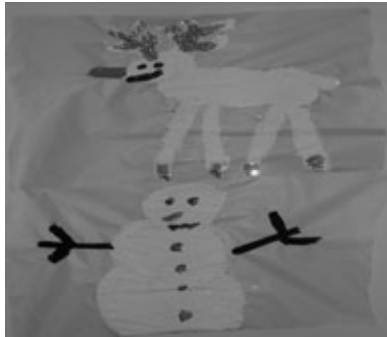
More art work from children.