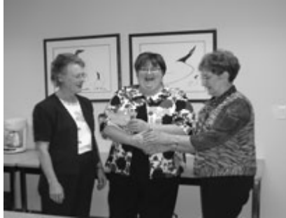
Al Amira-Daughters of Nile making a presentation to Wings.